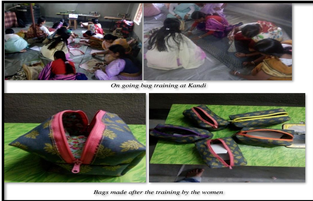
On going bag training at Kandi

These pouch bags were sent to Kolkata by a resource person. These pouch bags were a result of only three hours of online training. Looking at these products, the trainer said, “These women certainly have the outstanding skill to replicate things, what they need is finetuning of the